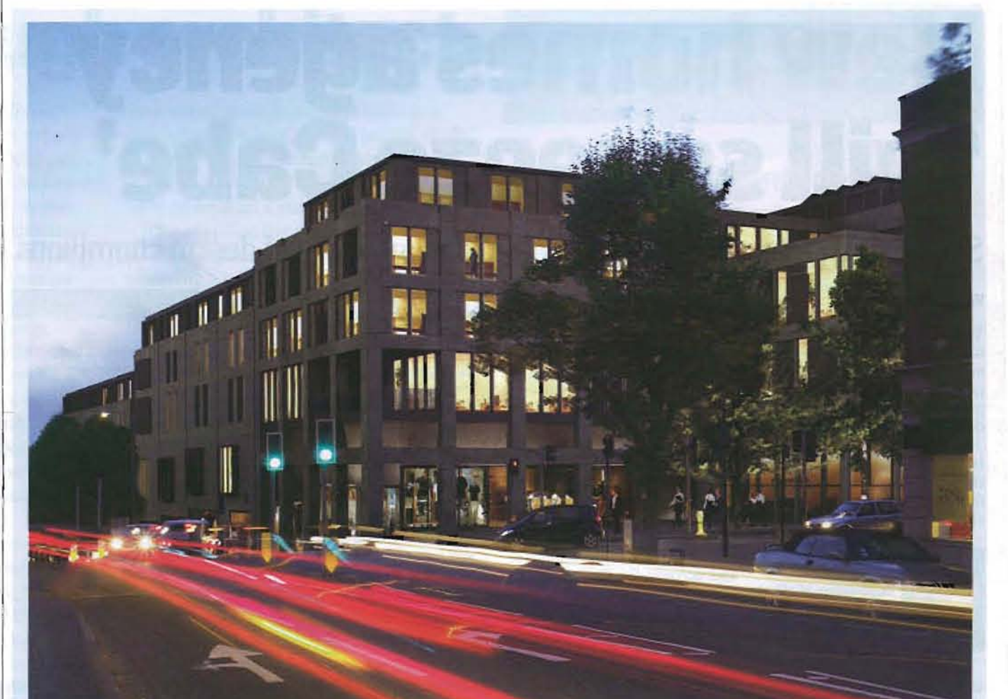
Since being selected, the scheme has grown to include 7,200sq m of office space, 9,900sq m of retail, and a hotel and restaurant.